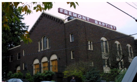
NOW - 1924 - 2024

And of course, there will be some refreshments. Our Tech person is working to transfer a video of the Chapel Train car, “Evangel” to USB so it can play on a loop during the open house tour. See you there!