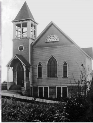
1901 First church on this site