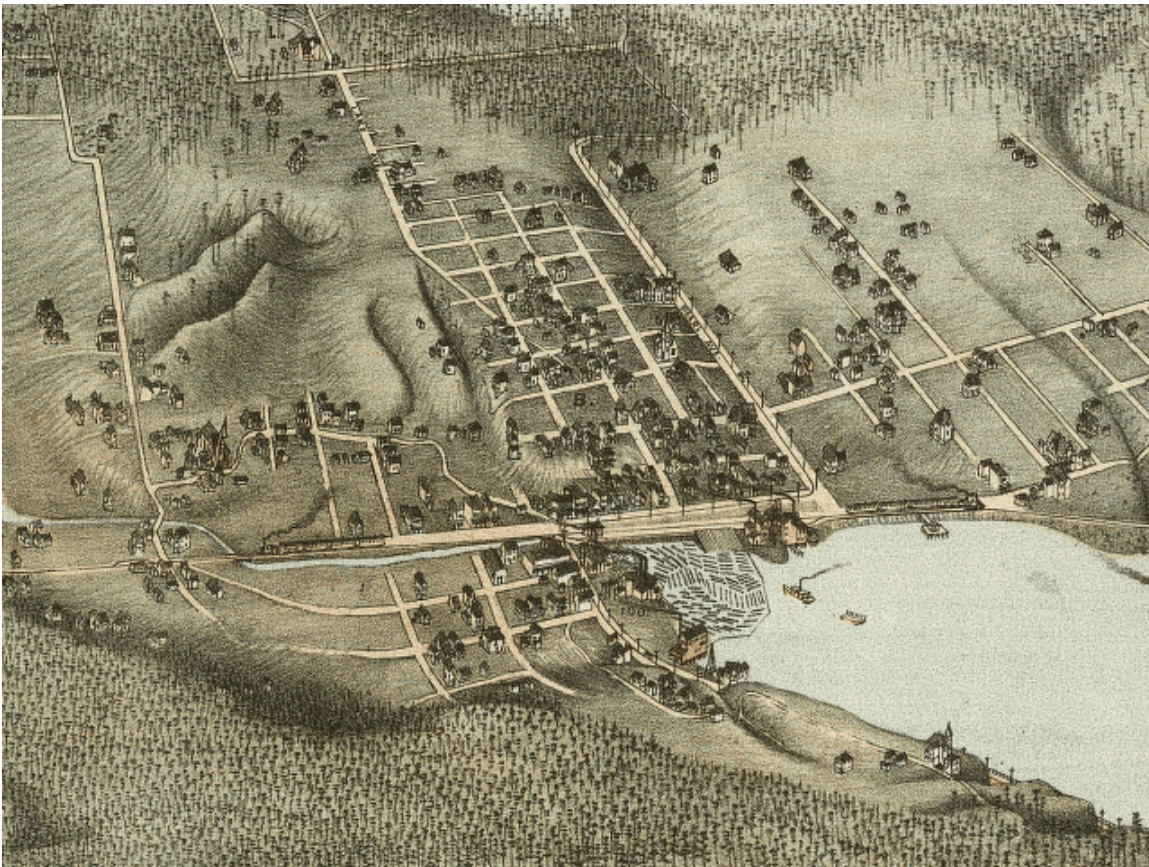
Birds-eye view of Fremont, 1891 [from Augustus Koch, Seattle and Environs King County, Wash. ]

Report Prepared for: Fremont Neighborhood Council January 2010